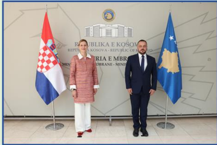
The Ambassador of the Republic of Croatia, Danijela Barisic