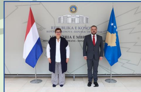
The Ambassador of the Netherlands, Carin Lobbezo