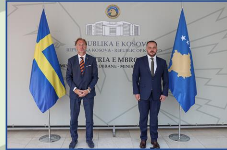
The Ambassador of the Kingdom of Sweden in Kosovo, Jonas Westerlund