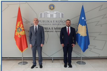
Chargé d'affaires of the Embassy of Montenegro in the Republic of Kosovo, Bernard Čobaj