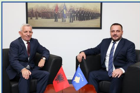
The Ambassador of the Republic of Albania in Kosovo, Qemajl Minxhozi